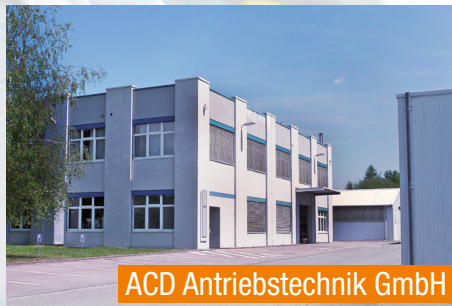
ACD Antriebstechnik GmbH

ACD Elektronik GmbH Development and manufacture of mobile devices and mobile applications in the field of industrial electronics