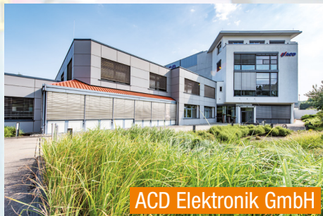
ACD Elektronik GmbH

ACD Elektronik GmbH Development and manufacture of mobile devices and mobile applications in the field of industrial electronics