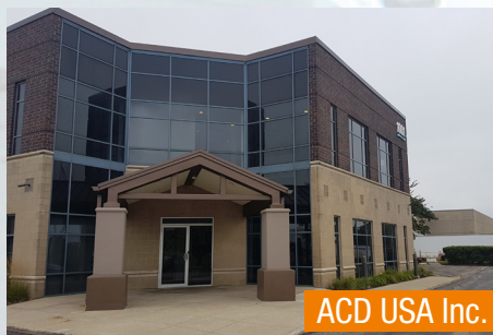
ACD USA Inc.

ACD Czech s. r. o. Electronic manufacturing services (EMS)