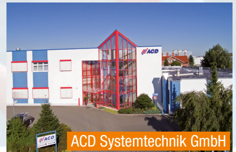
ACD Systemtechnik GmbH

ACD Antriebstechnik GmbH Development of requirement- optimised drive electronics