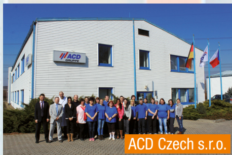
ACD Czech s.r.o.

ACD Systemtechnik GmbH Electronic manufacturing services (EMS)