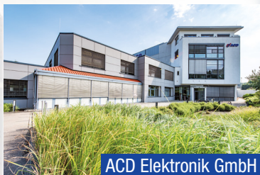
ACD Elektronik GmbH

Development and manufacture of portable devices and applications in the field of industrial electronics