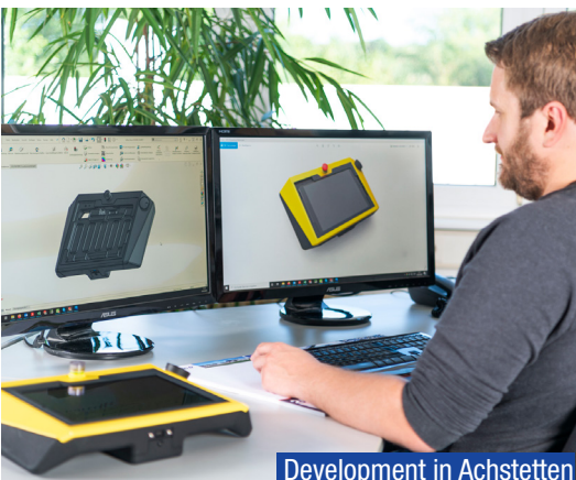
Development in Achstetten

ACD Elektronik wins the German Innovation Award and the IF Design Award for the M2Smart®