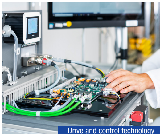
Drive and control technology