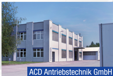
ACD Antriebstechnik GmbH

Development and manufacture of portable devices and applications in the field of industrial electronics