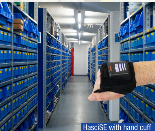
HasciSE with hand cuff