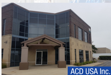
ACD USA Inc.