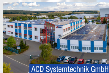
ACD Systemtechnik GmbH

Development of requirement-optimised drive electronics