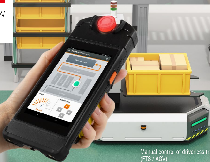
Manual control of driverless transport systems (FTS / AGV)